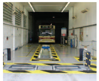
Dedicated VOSA and pre-VOSA pits