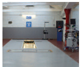
Class 4 ATL pit