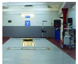
Class 4 ATL pit