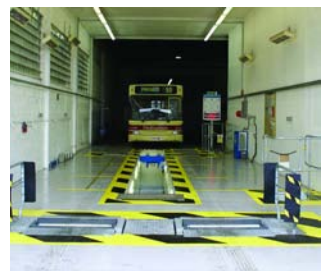
Dedicated VOSA and pre-VOSA pits