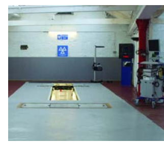
Class 4 ATL pit