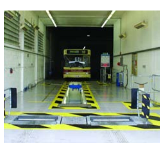
Dedicated VOSA and pre-VOSA pits